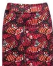
256 Fiery Red Multi