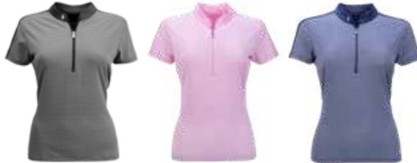
201 Black Multi