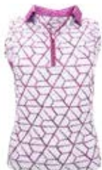
335 Iris Multi