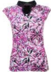
092 Hot Pink Multi