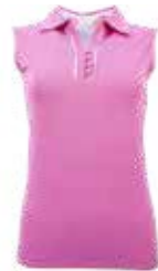
092 Hot Pink Multi