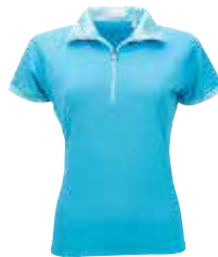
253 Peacock Multi