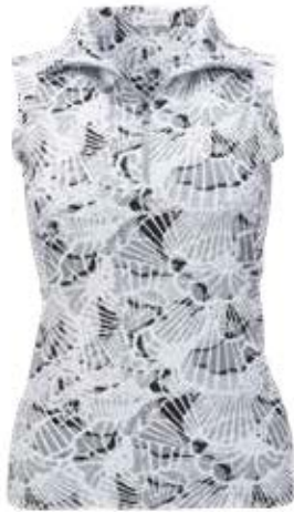
201 Black Multi