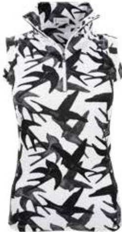
226 White/Black Multi