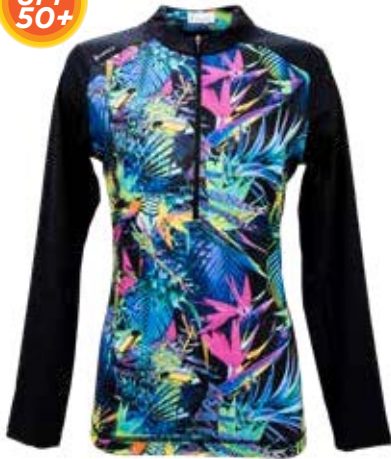
201 Black Multi