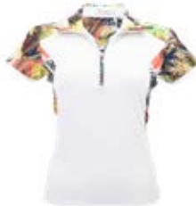
230 White Multi