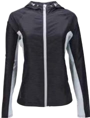
201 Black Multi