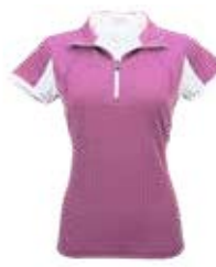
312 Iris/ White