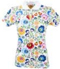
230 White Multi