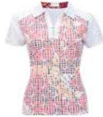
230 White Multi