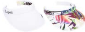
230 White Multi

90% polyester / 10% spandex jersey fully reversible visor. Contrast print on reverse side. Embroidered Lopez & Flame branding. ONE SIZE.