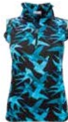
316 Black/Teal Multi