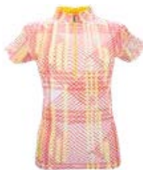
331 Lemon/White Multi