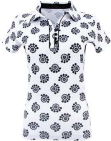
201 Black Multi