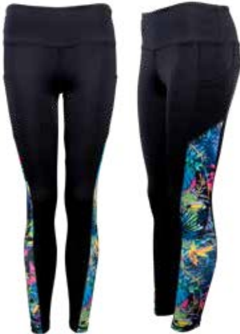
201 Black Multi