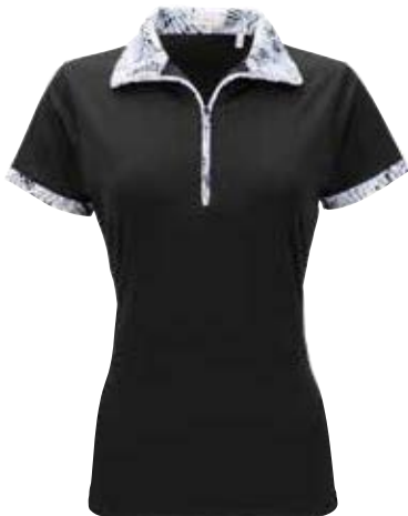
201 Black Multi