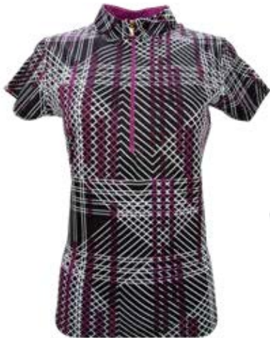
323 Iris/Black Multi