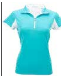
313 Teal/ White