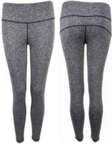
094 Black Heather