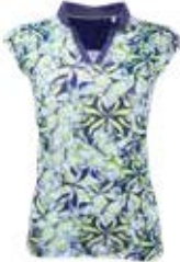
257 Midnight Multi