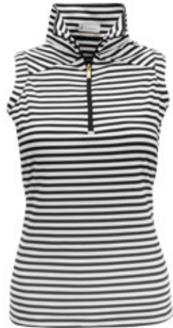
185 Black/ White