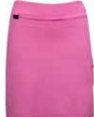
088 Hot Pink