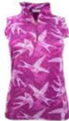
315 Iris/White Multi