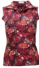
256 Fiery Red Multi