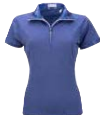
257 Midnight Multi