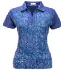
257 Midnight Multi