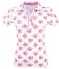
092 Hot Pink Multi