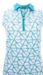
336 Teal Multi