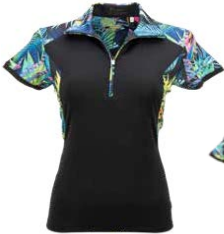
201 Black Multi