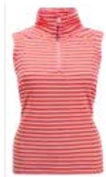
159 Fiery Red/ Flamingo