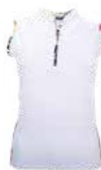
230 White Multi