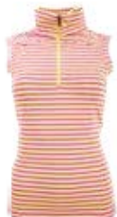
192 Hot Pink/ Lemon