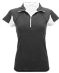
185 Black/ White