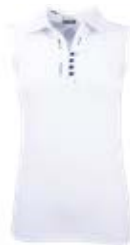
230 White Multi