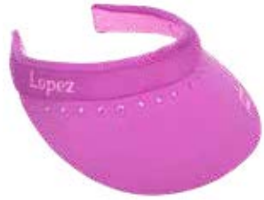
318 Iris/Hot Pink