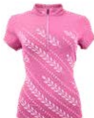
107 Hot Pink/ White