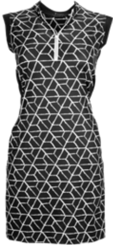
201 Black Multi