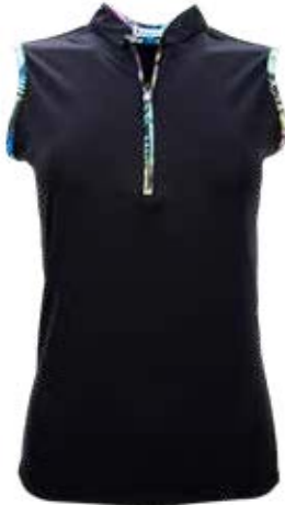
201 Black Multi