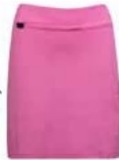
088 Hot Pink