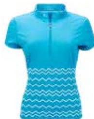
085 Peacock/ White