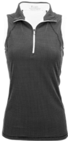
185 Black/ White