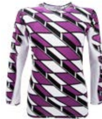
230 White Multi