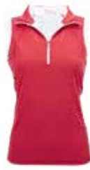
311 Cherry/ White