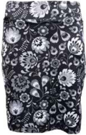
201 Black Multi