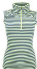
193 Midnight/ Lime