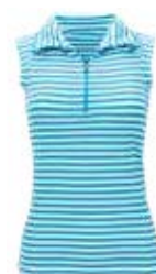
085 Peacock/ White