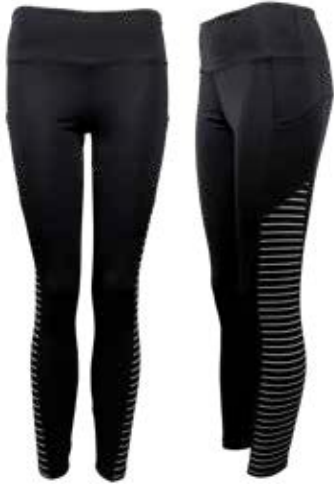
185 Black/ White