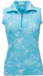
253 Peacock Multi