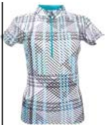
328 Teal/White Multi