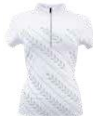
224 White/ Silver