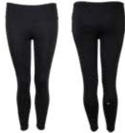
010 Black Back View