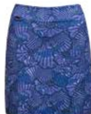
257 Midnight Multi