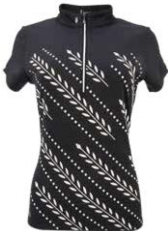
185 Black/ White