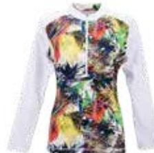
230 White Multi