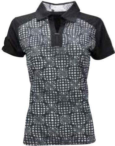
201 Black Multi