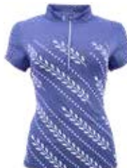
183 Midnight/ White