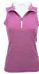
312 Iris/ White