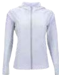
230 White Multi