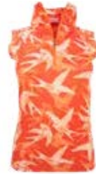
317 Tangerine/White Multi