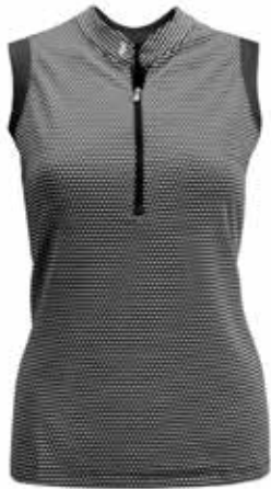
201 Black Multi