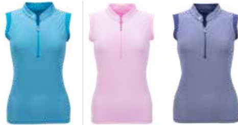
085 Peacock/ White