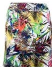
230 White Multi