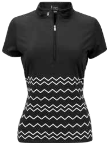
185 Black/ White