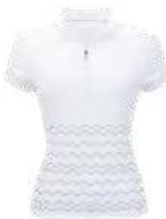
224 White/ Silver