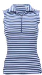
183 Midnight/ White