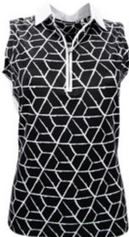
201 Black Multi