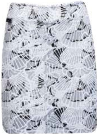
201 Black Multi