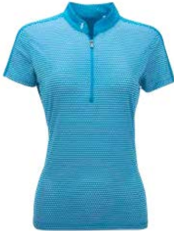
085 Peacock/ White