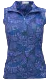
257 Midnight Multi