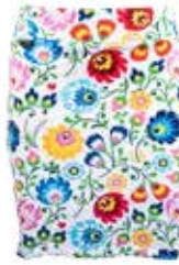
230 White Multi