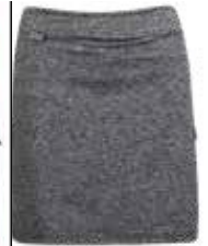
094 Black Heather