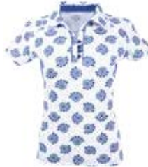
257 Midnight Multi