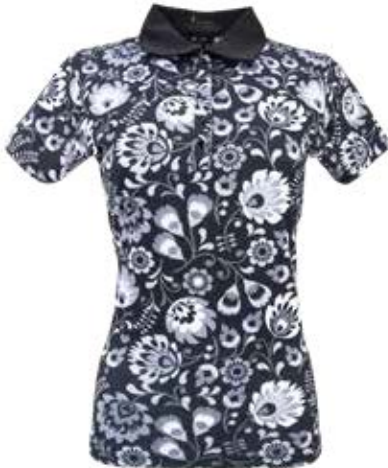
201 Black Multi